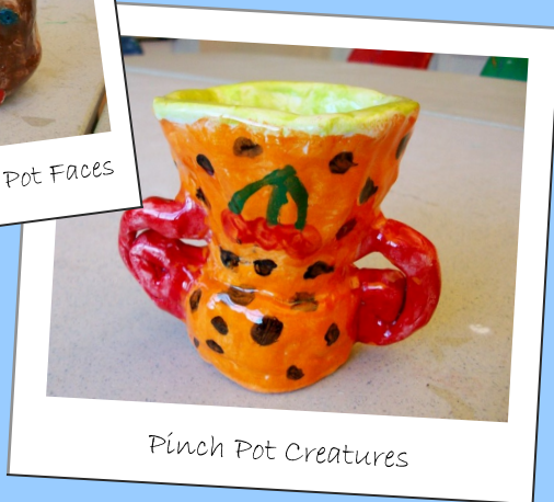
Pinch Pot Creatures