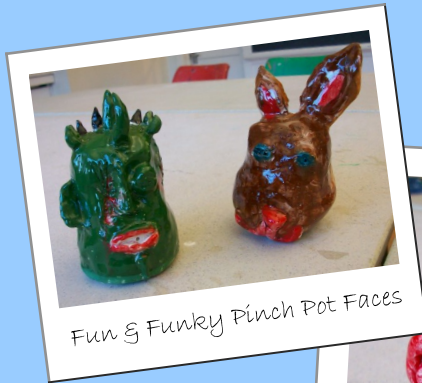
Fun & Funky Pinch Pot Faces

Choose your own creative party and our art staff will guide your group through a unique, exciting and playful experience!